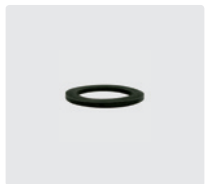
Flat seal. For F thread