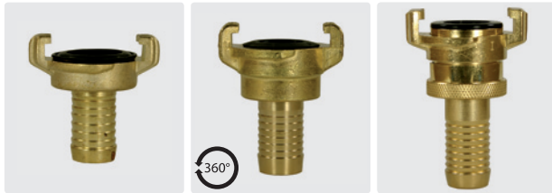
Straight. Brass Swivel straight. Brass Suction coupling *. Brass