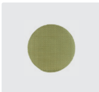
100 meshes/cm². Brass. Stainer insert. ⊘ 33 mm