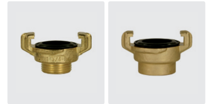
M thread. Brass F thread. Flat seal. Brass