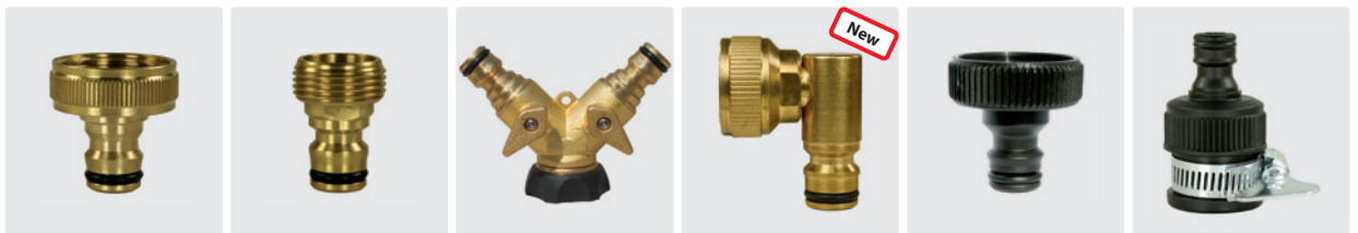
F thread. Brass. With flat seal M thread. Brass F thread. Brass + rubber. Double exit F thread. Brass. Angle swivel. With flat seal F thread. Plastic. With flat seal Plastic. Coupler plug for 12 - 18 mm