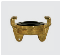
Bayonet blank coupling with gasket. Brass